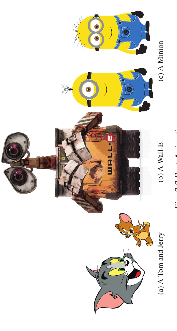
Fig. 2.2 Best Animations